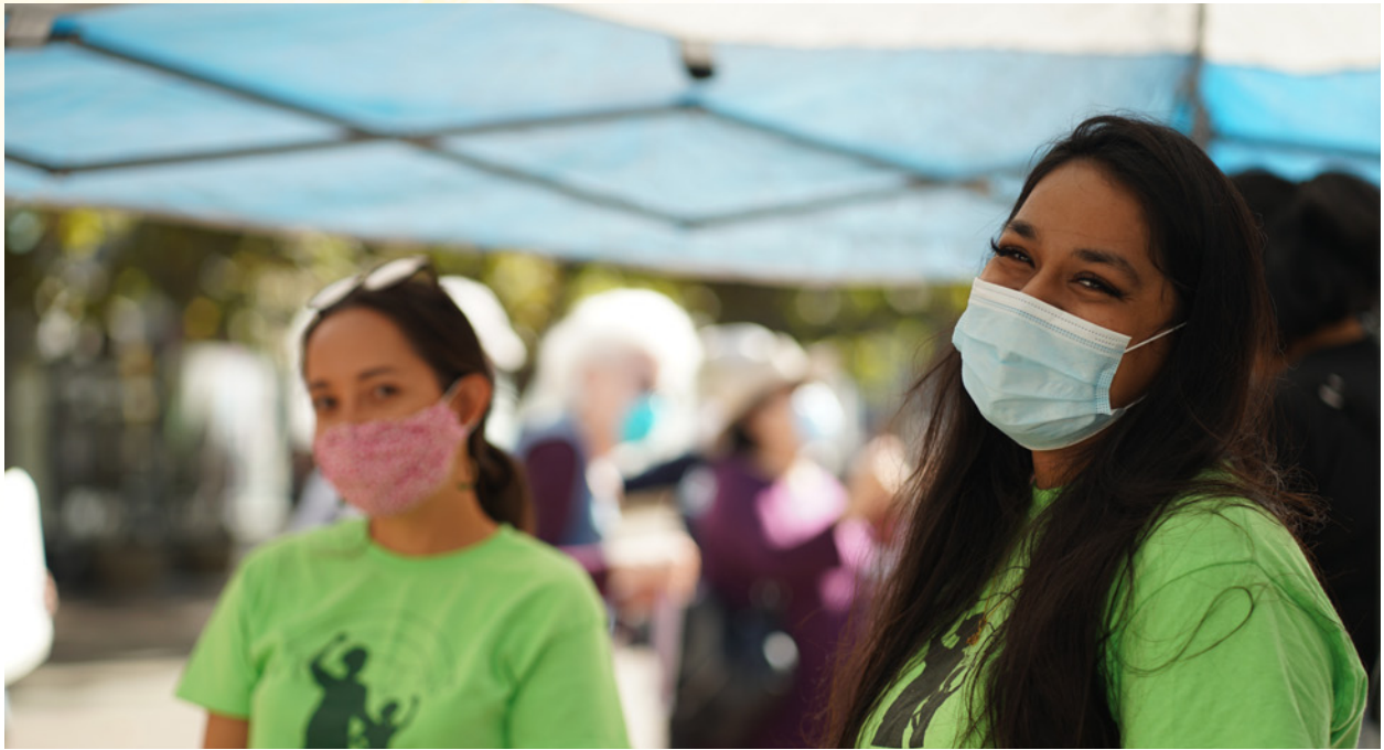
APEN staff at November Count Every Vote Rally