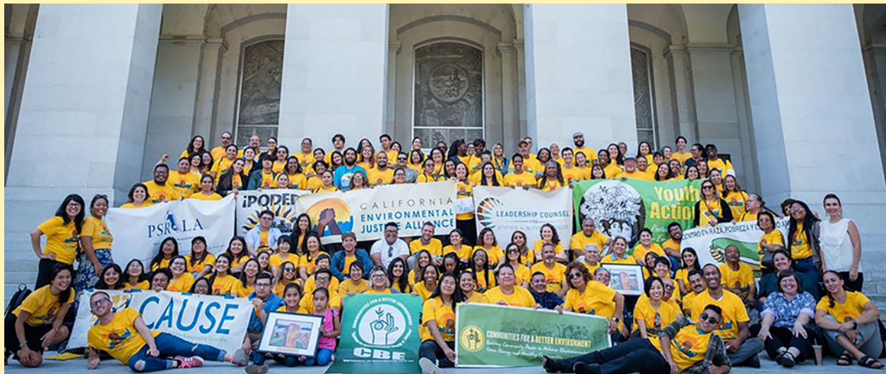
CEJA members and partners at CEJA's 2019 Congreso event

The California Environmental Justice Alliance (CEJA) is proud to release our 8th annual Environmental Justice Scorecard for the 2020 legislative session. This is the only scorecard in the state to grade California legislators specifically on their support for environmental justice issues — with an emphasis on legislation that impacts low-income communities and communities of color.