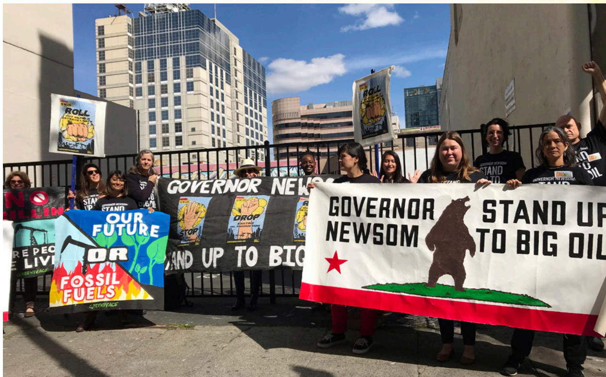
CRPE and CEJA members at an Oakland CalGEM rulemaking.