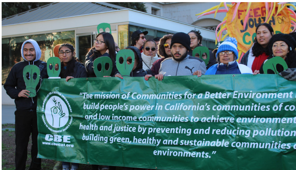
CBE and CCAEJ members at February 2020 launch of Regenerate California campaign

It is dismaying that in a time of crises, so many legislators strayed from environmental and social justice principles and policy solutions. We applaud the upstanding efforts of top-scoring legislators who were unwavering in their commitment. Despite statewide disappointments, this small group of decision-makers recognized the importance of addressing environmental health and justice issues that working-class communities and communities of color faced during the pandemic.