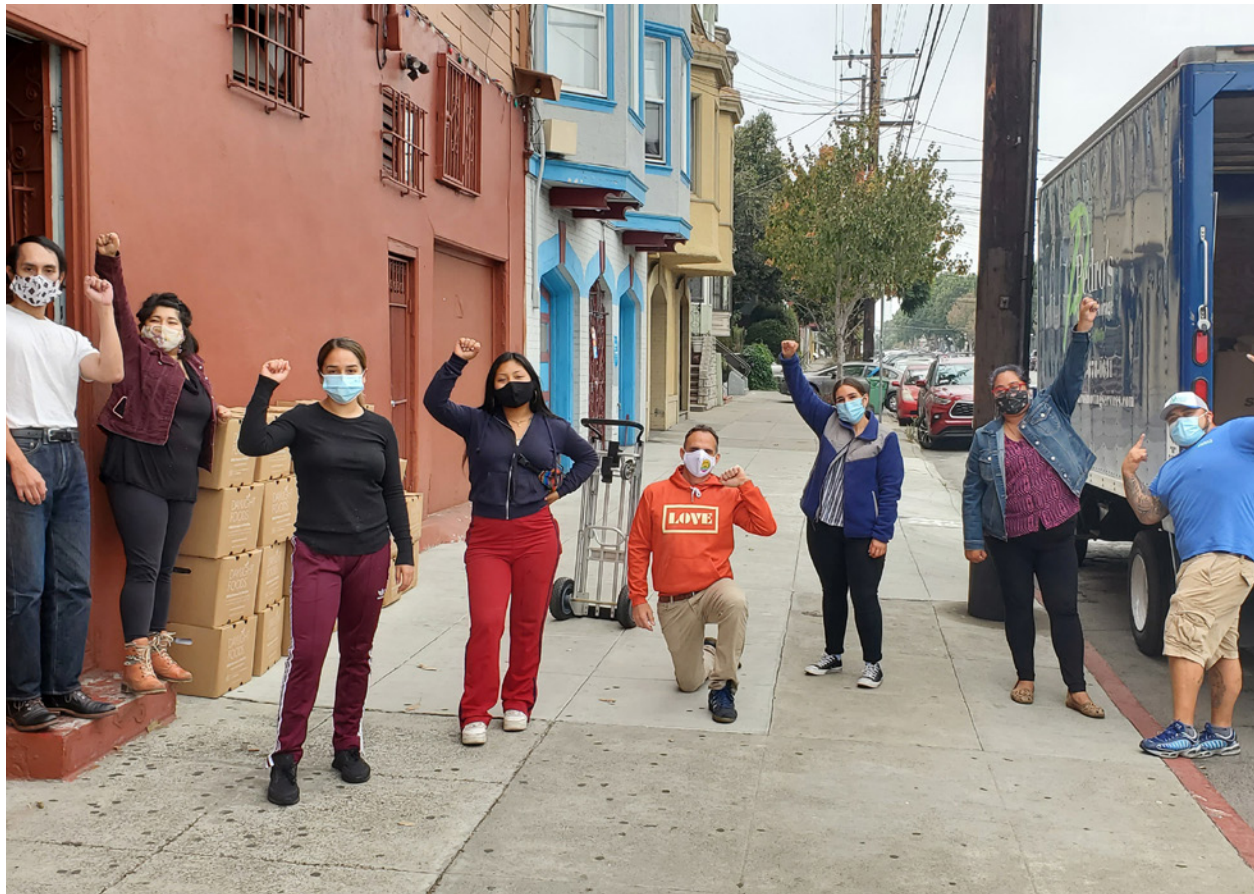
PODER members and staff prepare to deliver mutual aid for COVID-19 relief in the Mission