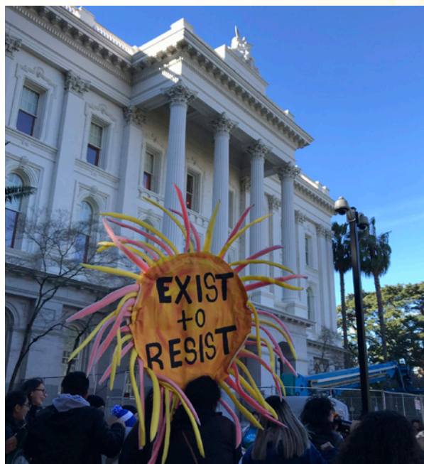
February 2020 launch of Regenerate California campaign

While voting records still compose the overwhelming weight of the scores, we hope that Community Points serve as a reminder that when it comes to environmental justice, a representative's job goes well beyond casting votes.