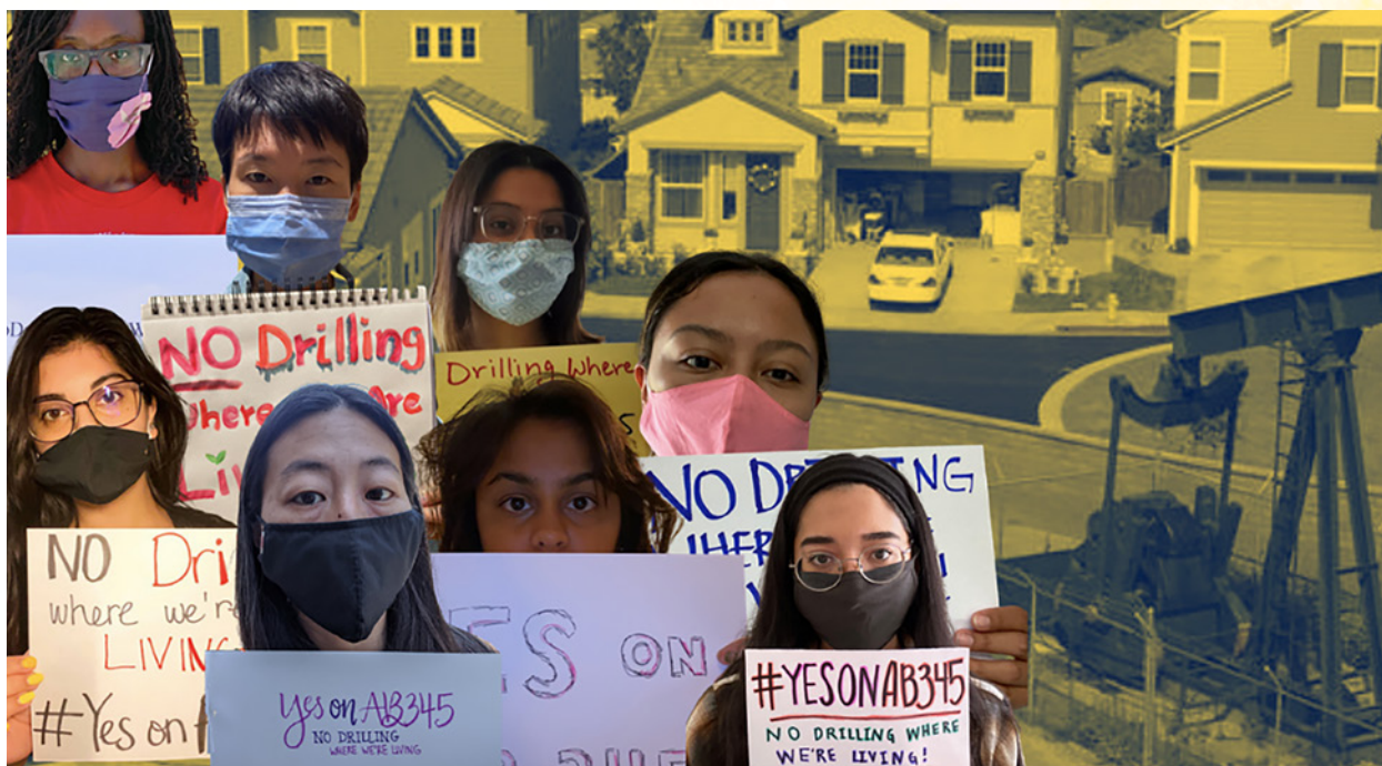
CEJA members and partners take social media action for health and safety buffer zones