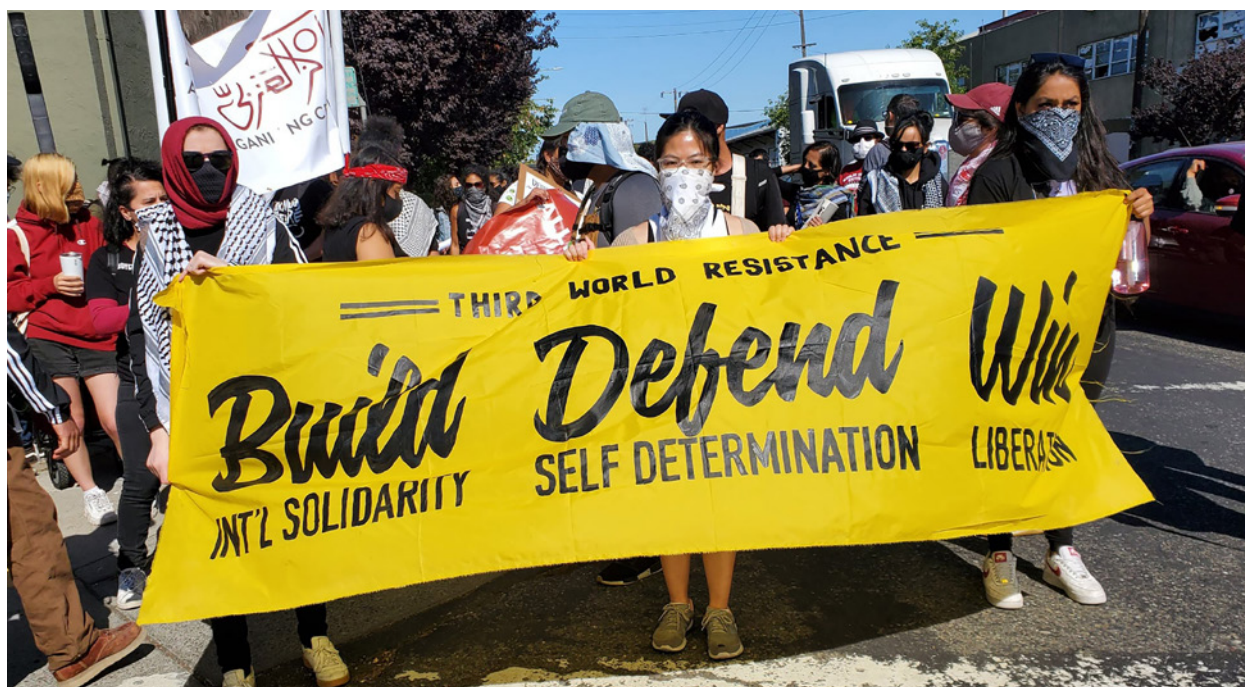
APEN staff join other members of the Third World Resistance at June 3rd #DefundOPD protest

As climate disasters intensify and racial inequities widen, there is an urgent need for environmental justice leadership in California. People of color are the new majority in our state, and will soon be the majority across the nation. Our legislators must meet the moment by passing policies to protect the health, safety, and economic welfare of our state’s most vulnerable communities.